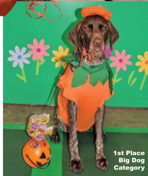
1st Place Big Dog Category