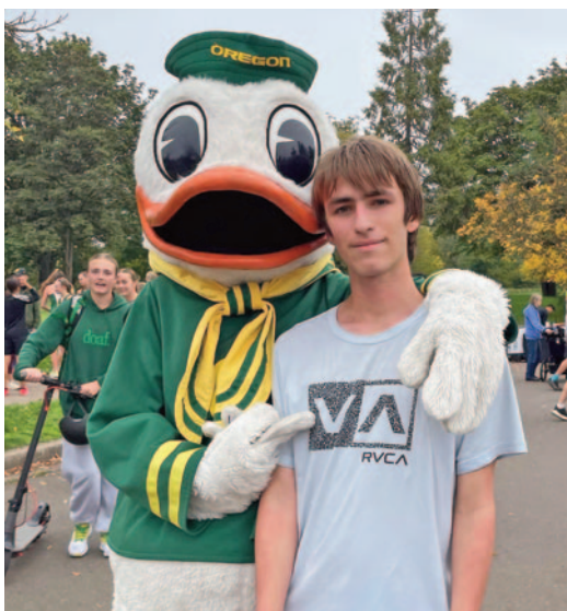
Who is the Oregon Duck's new friend? (5K event at the University of Oregon)