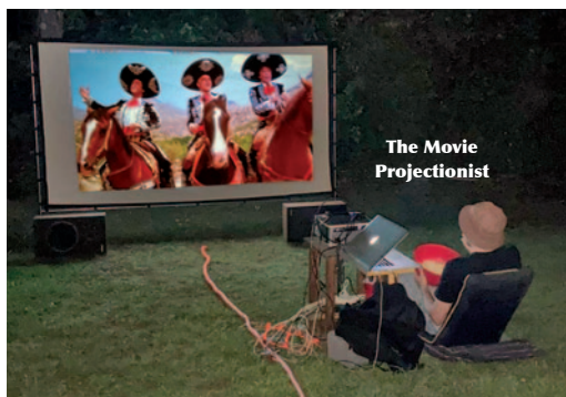
The Movie Projectionist