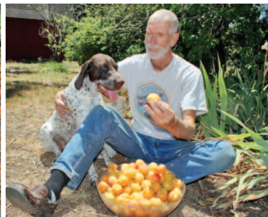
Left: Unreal scene in our woods, pine needles aglow from red sun caused by the many fires in our area. Right: This summer’s bumper apricot crop.