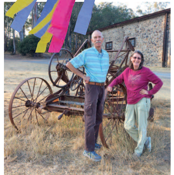
Celebrating our anniversary at Jack London Park