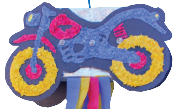
This year's Gray PEAR Affair piñata.