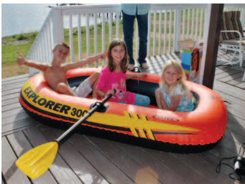
Boat fun at Big Lake, Washington