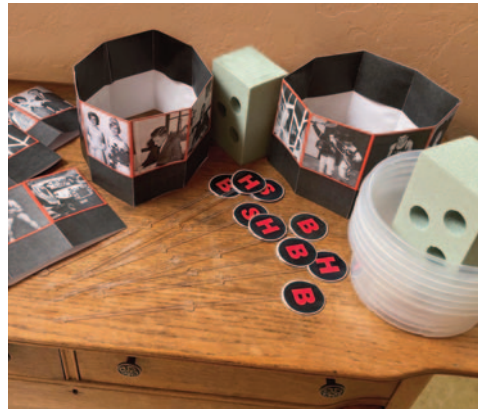
Sample of parts for 22 centerpieces for 60-year class reunion. Photos from yearbook. Final touches of greenery to be added