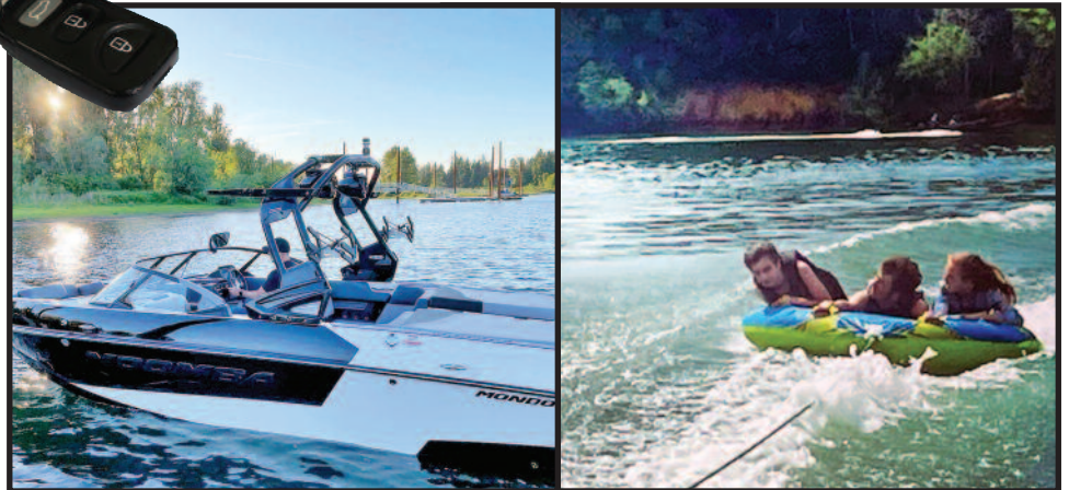
The Pines are always up to having fun in unusual ways. Check out the boat they recently bought. Check out those kids behind that boat.