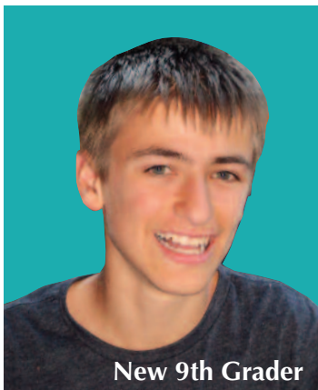
New 9th Grader