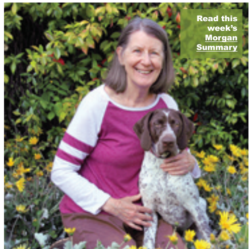
Read this week's Morgan Summary