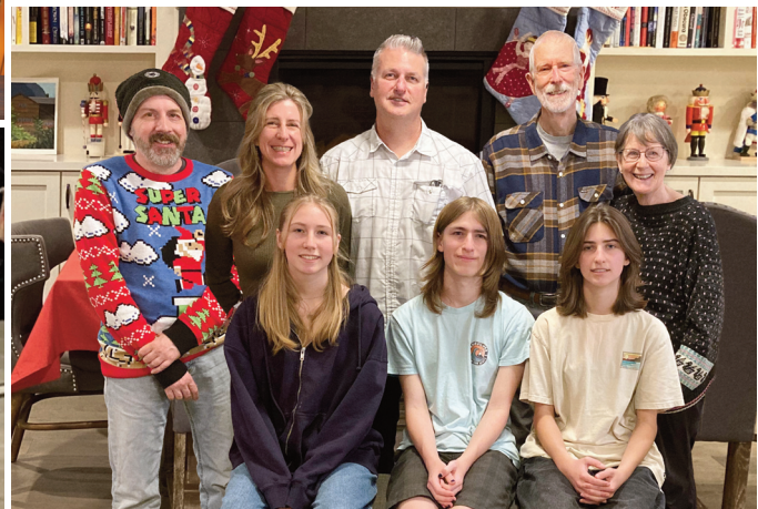
Christmas Eve Family Photo

Morgan is now being introduced to barn hunt and still goes to agility class, both on the same night. Brooklyn is entered in a barn hunt trial at the end of March and this time she will have to find four rats when she goes into the barn hunt arena. And, I am pleased to announce, on December 30th, we were given the news Brooklyn, Morgan, and I passed our brace performance in the November Dogs Can Dance® Challenge scoring 144 points and placing second out of a total of 11 entries in the challenge. You can view our performance by visiting youtu.be/tasbaf5eaXQ